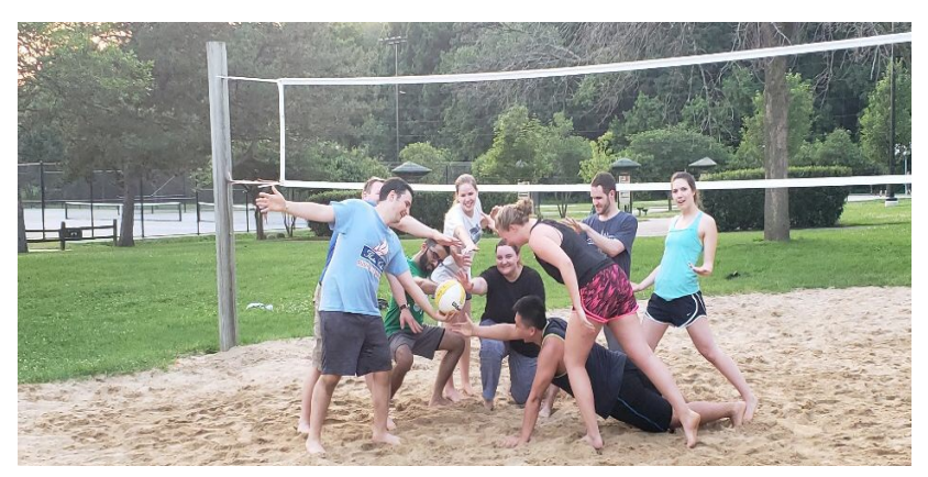
The residents get together to play volleyball and try not to pull any muscles