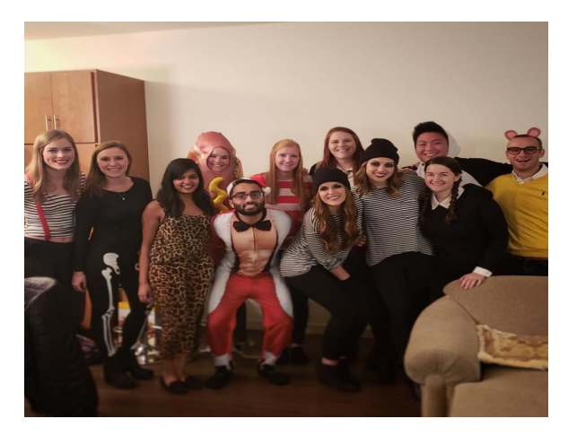
Showing that you are never too old to dress up for Halloween