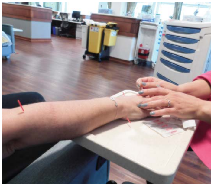
Patient receiving acupuncture during a chemotherapy infusion visit.